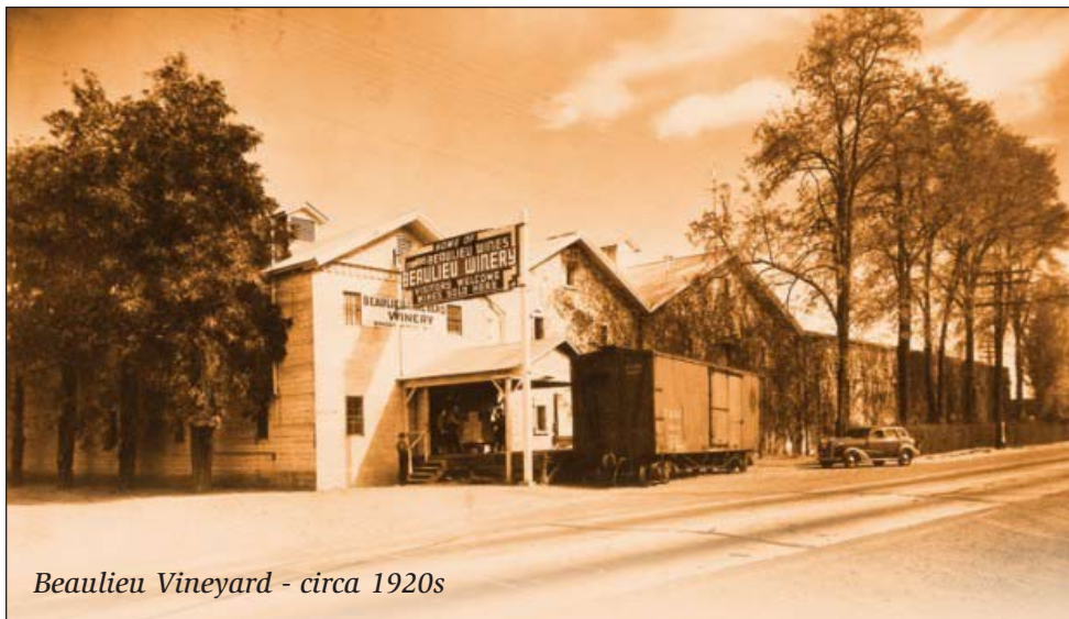
Beaulieu Vineyard - circa 1920s